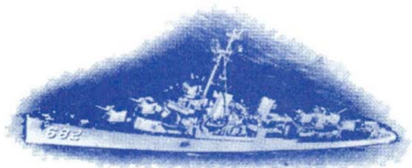
U.S.S. PORTERFIELD DD682