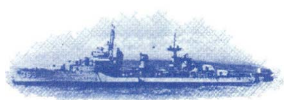
U.S.S. BALCH DD363

The plan is to attend the Memorial Day Ceremony at the Nimitz Memorial.